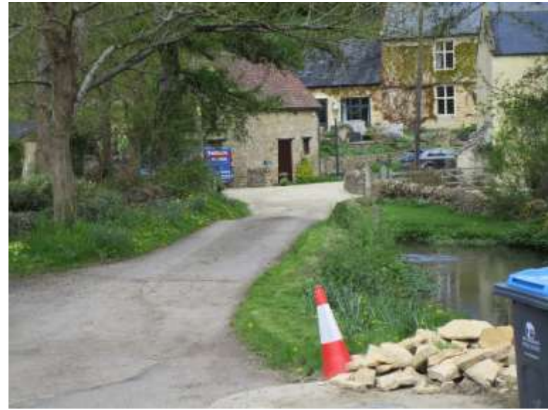
Photo 7 On arrival at road in Cleveley .... bear rt. (S) on small metalled rd. over R. Glyme then immediately l. (E) (blue van)