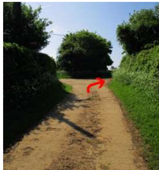
Point 16 Photos 22, 23 .... from fork follow concrete drive between hedges. Where it bends left (again, no waymark) leave to rt. with lone tree to left to join FP along field edge.