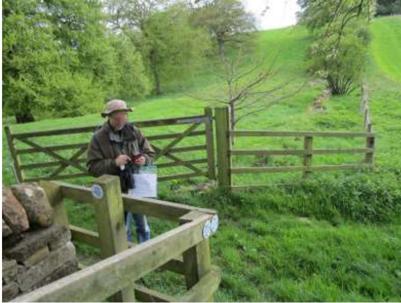
Route Notes Point 11 (cont.)

Glyme Valley Way - photographs to aid navigation. See detailed Route Notes.