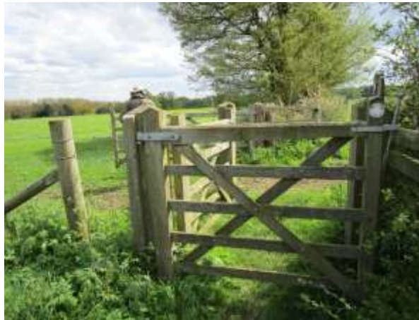
Route Notes Point 11 Photos 13 and 14

L. (E) at jn. of bridleways, to l. (N) of hedge.