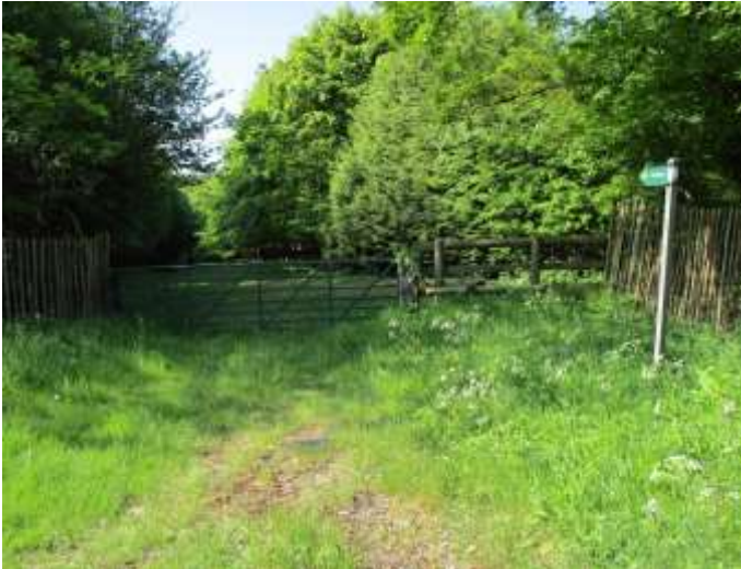
Route Notes Point 15 Glympton Wood: Photo 18 200m past Glympton Turn, at FP sign on rt. (S) leave A44 rd. through gate ....