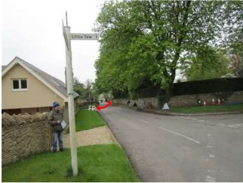
Route Notes Point 8 Photo 6 Church Enstone ... go rt. (SSE) onto unsigned single-track rd. just before a left turn (to NNW) to Little Tew.