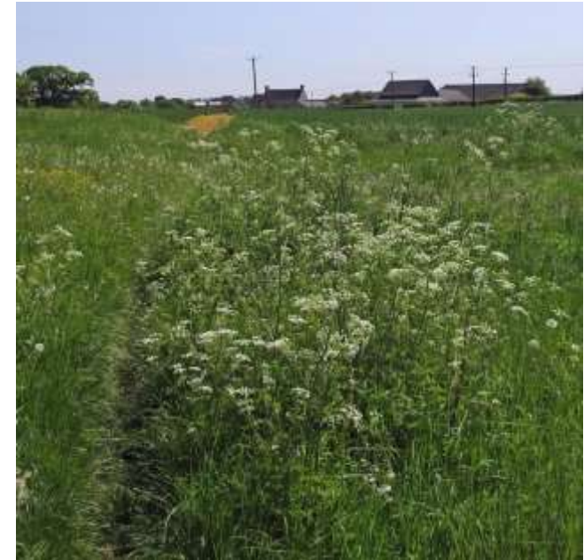
Point 17 (cont.) Photo 30 Turn rt. to leave Hordley Farm drive and cross paddock ..... then field to reach Sansoms Farm Photo 31