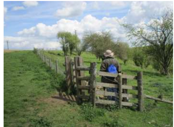
Gate at GR396238