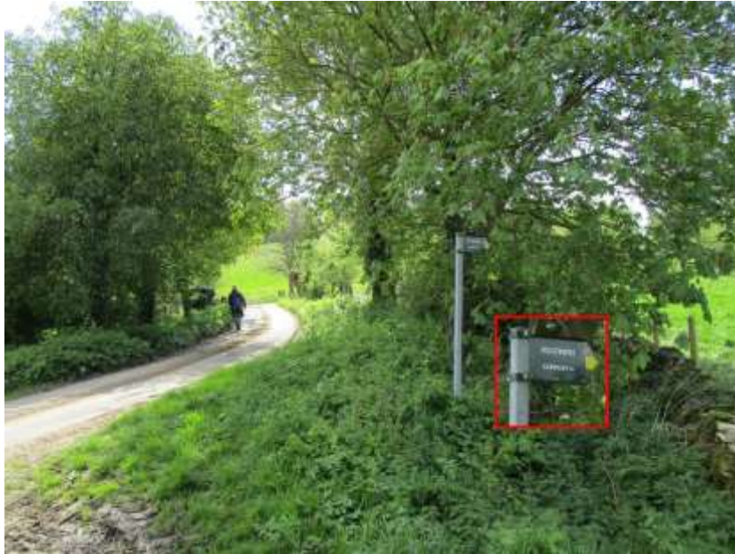
Route Notes Point 10