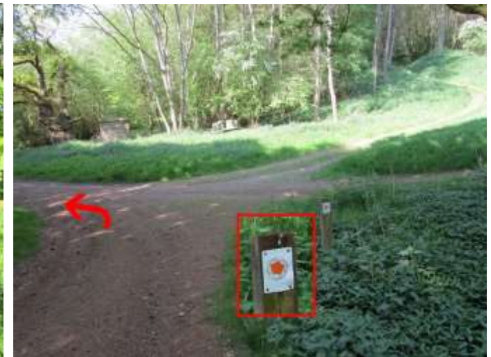
Photo 20 GR 4185 200. Change maps here. Where track meets two more, at waymark post bear l. (S.). Cross River Glyme and climb SSE.