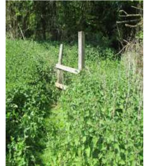
Point 16 (cont.) Photos 24 & 25: the same spots in February and May