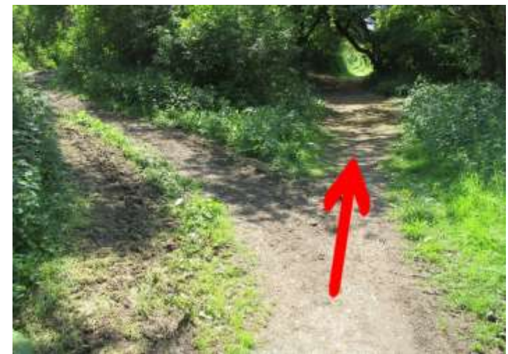
Point 18 Photos 32, 33 After passing Sansoms Farm, leave B rd., cross field to bridleway. About 3 mins. along it, fork rt. to reach Woodstock.