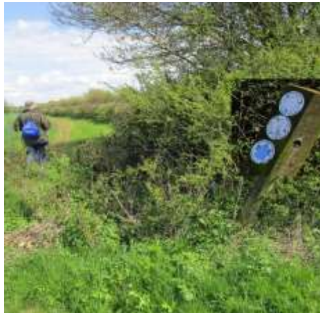
<Point 10 <Photo 12

<GR402232 approx. 7 minutes' walk from Radford Bridge