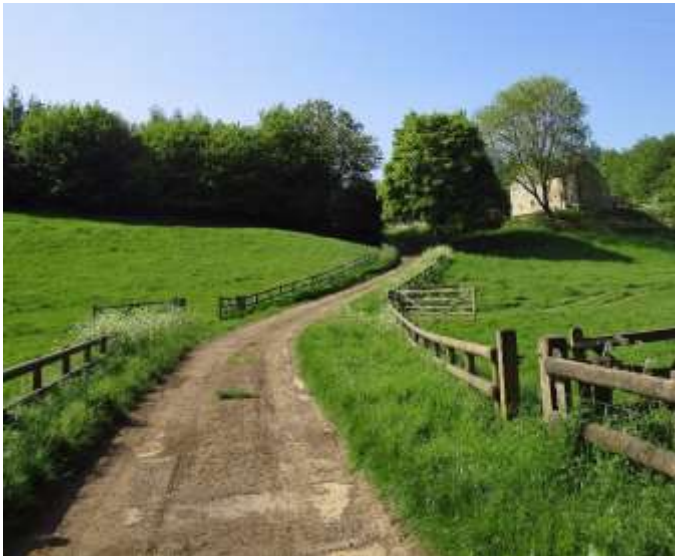
Point 15 Photo 21 .. climb past Glympton Assarts farmhouse and at top of slope fork l. (no waymark).