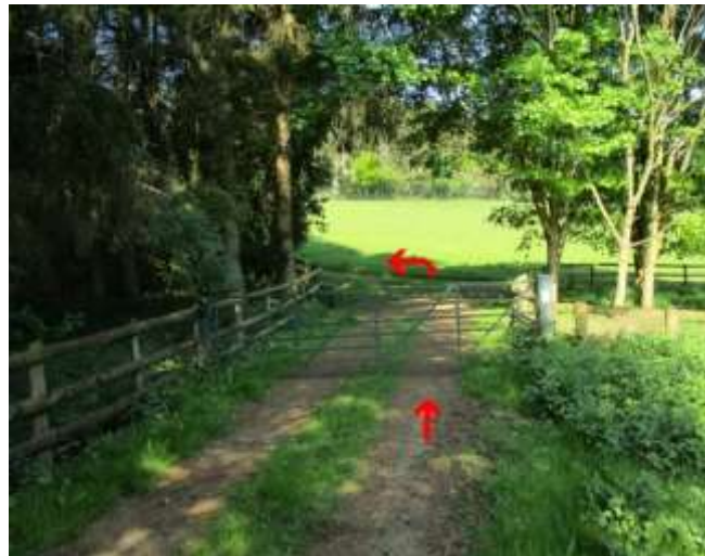
Photo 19 Through wide gate turn l. (S) on waymarked track up hill then descend again to W. (reaching point shown in Photo 20).